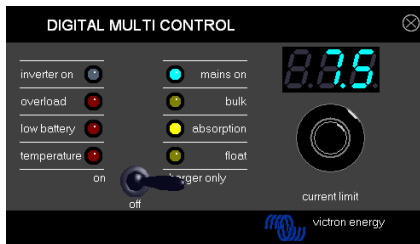
Figure 0.1 - Front view of the Digital Multi Control panel

The DMC is used to remotely set up to four (five including the generator functionality) different input currents, read out the status of your system and turn on and off the Multis or Quattro's.