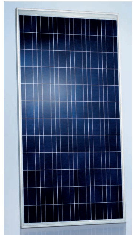
SCHOTT POLY™ 165/170/175/180