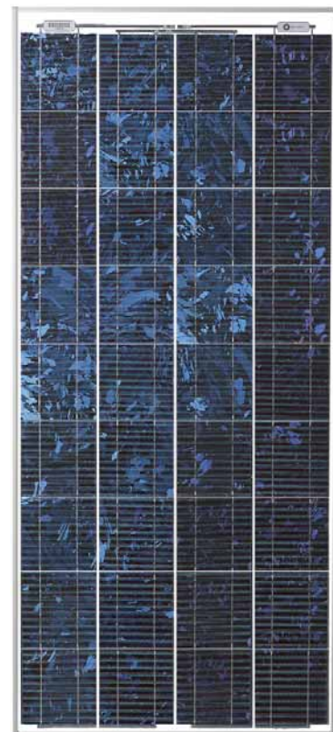
BP 380S scale 1:14

Laminates recognised by Underwriter's Laboratories for electrical and fire safety (Class C fire rating)